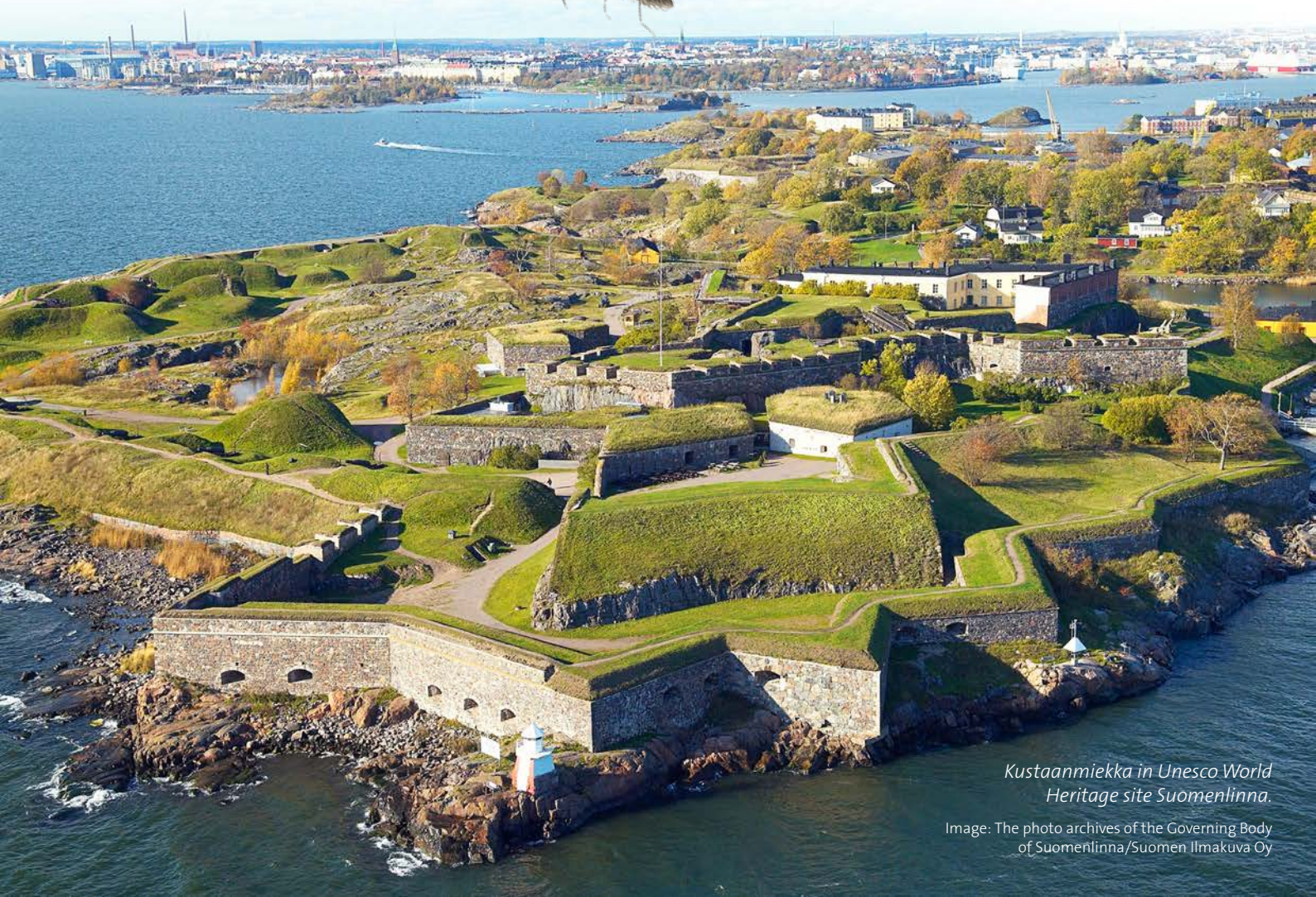
Kustaanmiekka in Unesco World Heritage site Suomenlinna.