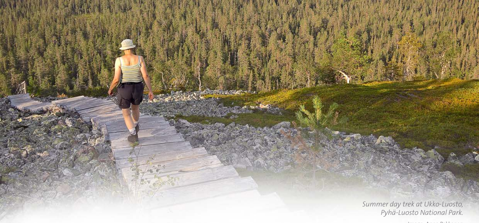
Summer day trek at Ukko-Luosto, Pyhä-Luosto National Park.